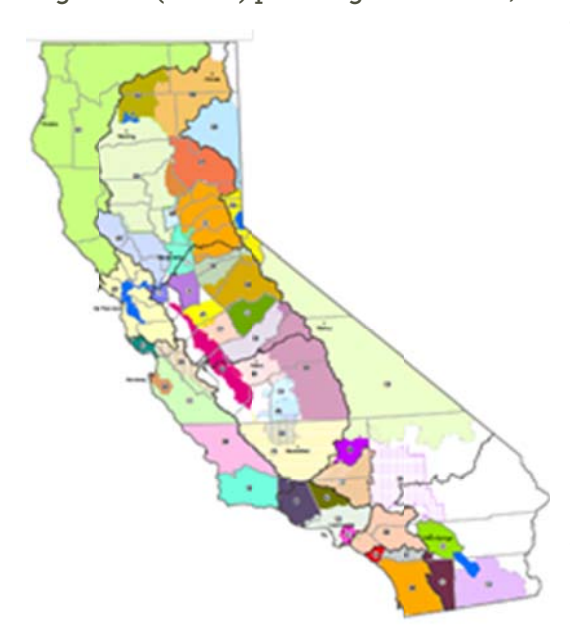
There are currently 48 approved Integrated Regional Water Management planning regions located throughout California.

Nearly ten years ago, the State of California embarked on a new venture to implement integrated planning at the regional level, known as Integrated Regional Water Management (IRWM) planning. Over time, this program has evolved into a major