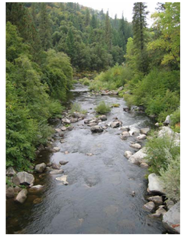
MokeWISE will consider a wide variety of supplies in addition to surface water from the Mokelumne River.

Serve on the stakeholder committee. The MAC and ESJ Regional Water Management Groups are in the process of assembling a stakeholder committee to represent